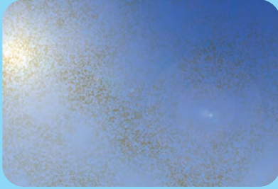
1. The window is exposed to daylight.