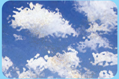
5. Dirt is washed away by rain.