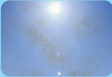
2. Daylight triggers the Pilkington Activ™ coating.